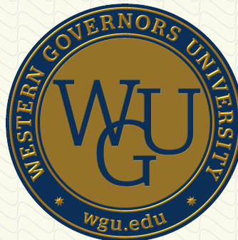
CHAIR, BOARD OF TRUSTEES